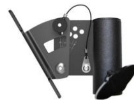
Optional Pole Mount Adapter