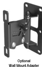
Optional Wall Mount Adapter